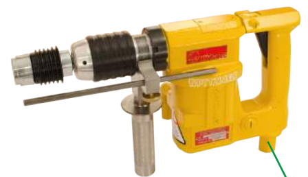
Hydraulic or pneumatic type