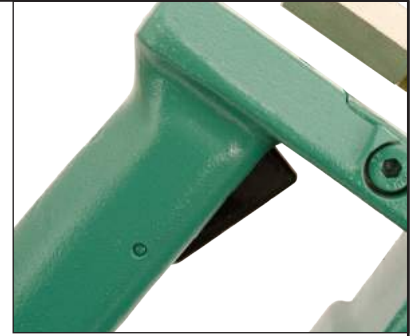
Handle with lever control